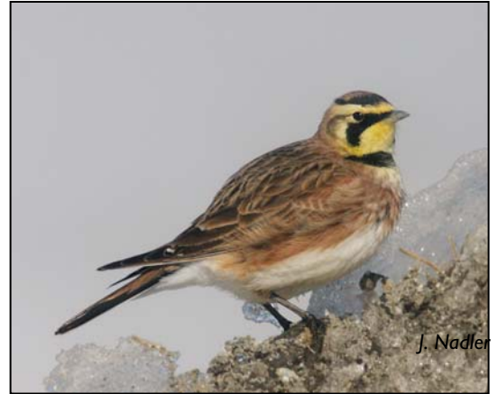
Ideal American Kestrel habitat contains open fields with scattered perches.

The male has small black "horns" and a black line under his eye extending from bill to "cheek." It has a yellow to white face, a pale throat, dull brown upperparts with a black breast band, and a dark tail with white outer tail feathers. The female is similar to the male, but has slightly duller-plumaged.