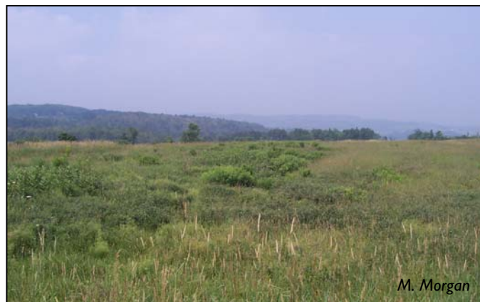
Grassland habitat in NY