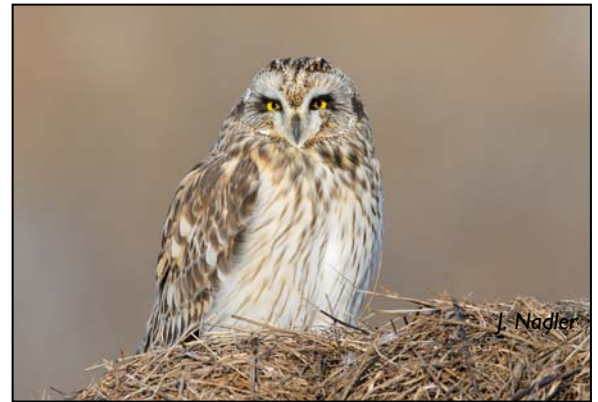
Blocks of habitat greater than 250 acres are essential for Short-eared Owls.