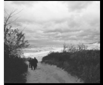
Planners access the beach on a windy day in January.