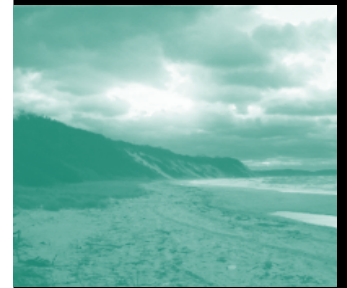
A westbound view of the KeySpan beach and bluffs.