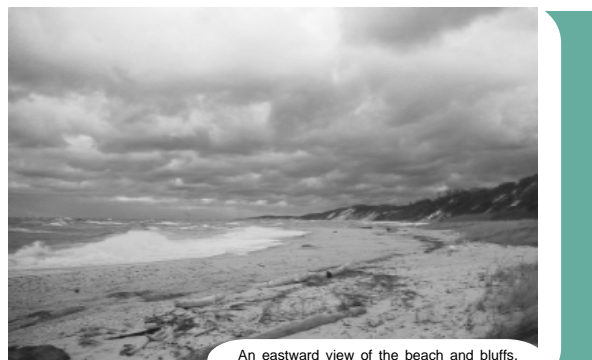
An eastward view of the beach and bluffs.