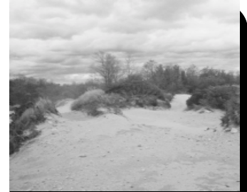
A partially vegetated dune on the KeySpan property.