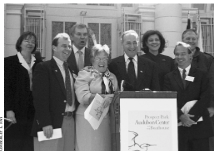
Senator Chuck Schumer and other dignitaries enjoy a light moment during Prospect Park Audubon Center opening.

Already, the migratory warblers were beginning to arrive just in time for this new Audubon urban education center, which showcases "state of the art" environmental education exhibits. The building, the exhibits, the classroom, the educational programming as well as the high level officials who attended made for an impressive day.