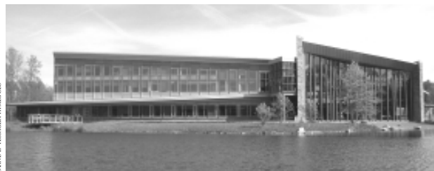
The new Cornell Lab of Ornithology in Ithaca, New York.

Science and conservation projects on which Audubon's bird conservation and CLO staff collaborate include Important Bird Areas, New York State's Bird Conservation Area Program, the New York Breeding Bird Atlas, regional and state bird conservation planning, species atlases, and habitat stewardship programs. In education, CLO programs are utilized in concert with Audubon programs at Audubon Centers as well as within Audubon's For the Birds! urban environmental education programs. Educators from all Audubon centers in the state met for a "brain drain" session at the CLO in September to share ideas and increase collaboration.