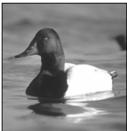
Bashakill Wildlife Management Area is a BCA that provides an enticing habitat for birds including the Canvasback Duck.

Bashakill Wildlife Management Area — This BCA, which includes the entirety of the Bashakill Wildlife Management Area in the Town of Mamakating in Sullivan County, was dedicated by Governor Pataki on June 16, 2000, at Audubon's national board meeting at Bear Mountain (See story on page 1.) Habitats at the site are primarily