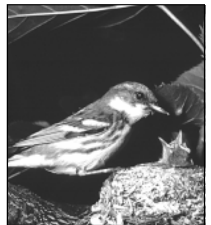
The Fahnstock BCA is home to several hardwood forest breeders including the Cerulean Warbler.

large stands of hemlock and some white pine and several lakes, streams and marshes. The valuable habitats of this BCA support a healthy representative community of hardwood forest breeders including Broad-winged Hawk, Ruffed Grouse, Barred Owl, Acadian Flycatcher, Whip-poor-will (a species of special concern), Northern Raven, Hermit Thrush, Black-throated Green Warbler, Prairie Warbler, Cerulean Warbler (a species of special concern), Worm-eating Warbler, Hooded Warbler, Canada Warbler, Northern Waterthrush and Dark-eyed Junco, among others.