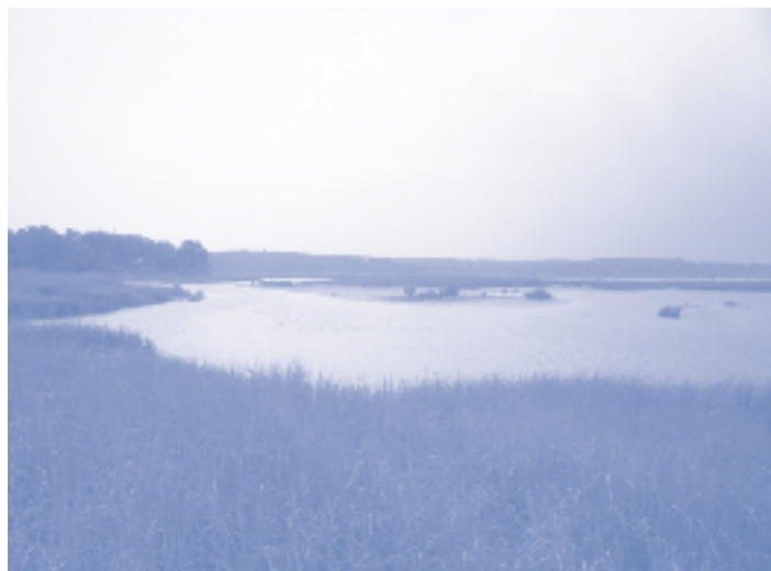
Tim Holstrom c/o The Trust for Public Land

It is recommended that the states and federal government provide community assistance funds to all coastal communities to establish local open space plans, as well as waterfront revitalization plans for their communities. These planning processes will not only identify critical parcels in need of protection, but will also provide direction to local towns on where their zoning laws may need to be changed to protect the character of their communities and Long Island Sound coastlines. Zoning could be used, for example, to reduce development densities, increase setbacks, and require vegetative buffers in designated conservation areas.