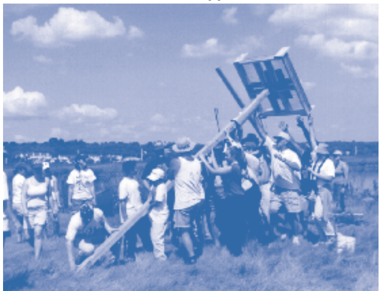
Quinnipiac River Watershed Association

II. Creation of a Long Island Sound Open Space Account. It is recommended that the states of New York and Connecticut create a Long Island Sound Open Space Account. Each state already has land protection funds in their annual state budget. Therefore, it is recommended that each state at a minimum: