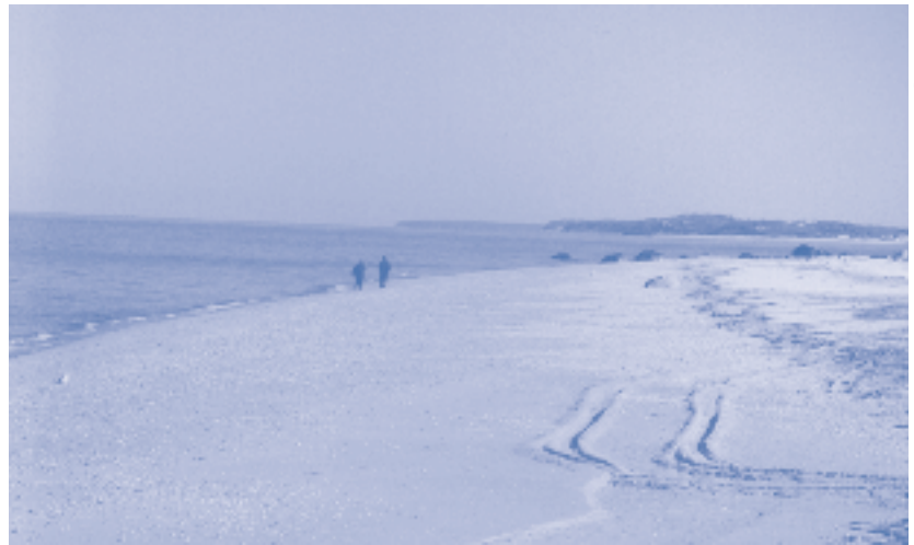
North Fork Audubon Society