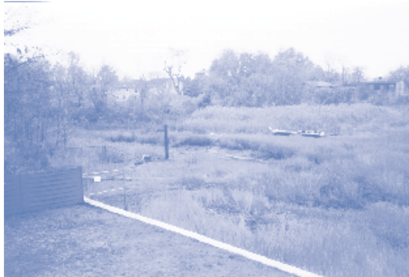
City Island Marsh

In addition to the last remaining wetlands on City Island (which include a freshwater creek between Tier and Ditmar Streets),