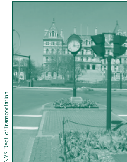
NYS Dept. of Transportation

State agencies should take the lead in promoting the expanded use of clean fuel vehicles in New York.