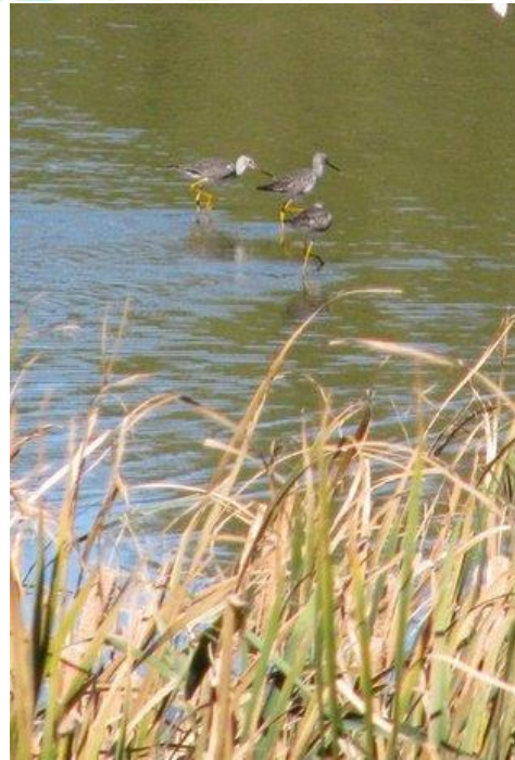
Name the spp. – at Times Beach in October.