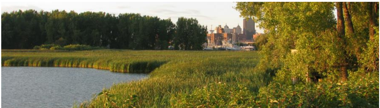
Times Beach Nature Preserve

(we can't promise that there will or won't be snow)