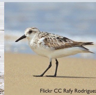
Sanderling NY State Species of Potential Conservation Need