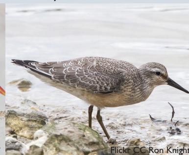
Red Knot NY State High Priority Species of Greatest Conservation Need Federally threatened