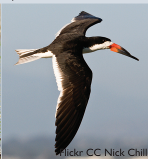
Black Skimmer NY State Species of Special Concern