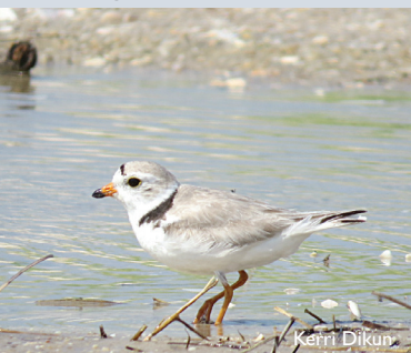
Piping Plover NY State Endangered Federally Threatened