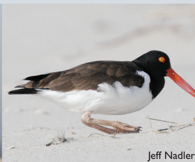
American Oystercatcher NY State Species of Greatest Conservation Need